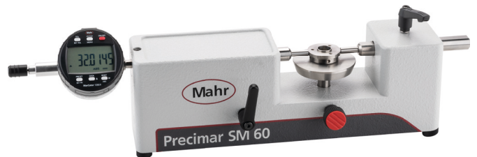
Shown with optional MarCator 1086